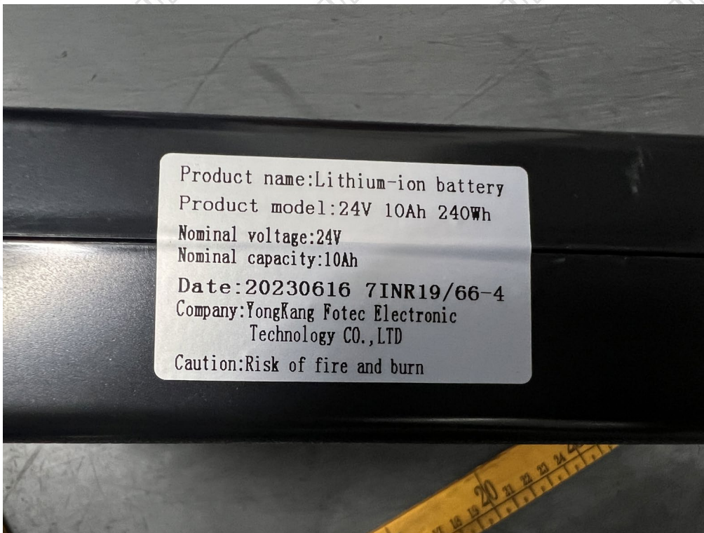
Figure 4 Battery label (电池标签)