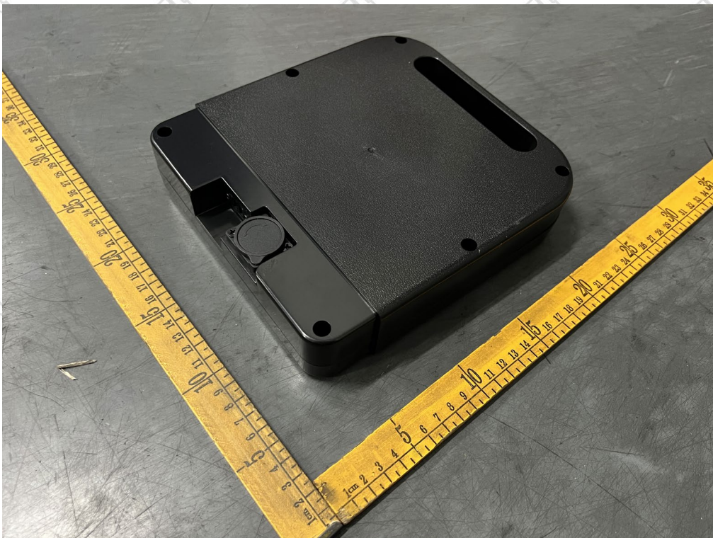
Figure 2 Overall view II of battery (外观图II)